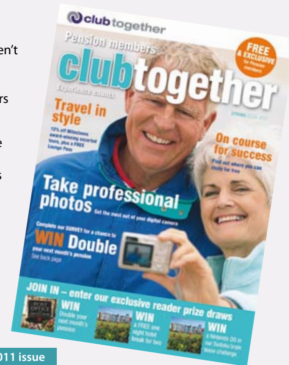
Spring 2011 issue

And we haven't sent you a magazine if you previously told us that you don't want information on discounts and offers from us. However, if you'd like to try Club Together, just phone us on 01274 434999 and we'll make sure you get the next edition of Club Together.