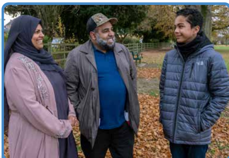
Foster carers provide homes for children and young people, offering them love, support, and a sense of belonging.